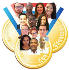
Laboratories Recognized for Outstanding Quality Assurance Page 3