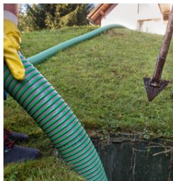
Fulton County Residents learn to be Septic Smart Page 4