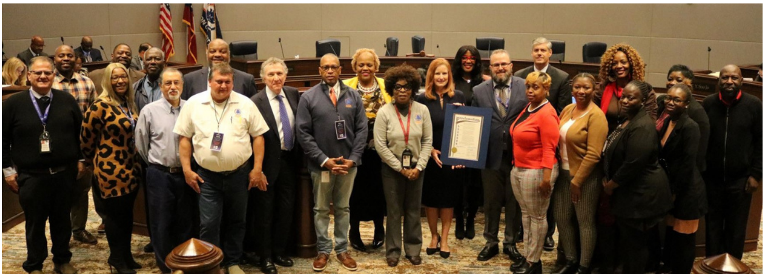
Public Works employees receive a proclamation from the Board of Commissioners in honor of Clean Water Week

Recently we celebrated another Clean Water Week, as was mentioned during the Proclamation Ceremony with the Board of Commissioners, I am very grateful that I work with a large number of staff that treat every day as Clean Water Week. While it is nice to be recognized for what we do, truth be told the number of activities that all of Public Works complete on a daily basis improves the daily lives of everyone in Fulton County – whether they recognize it or not. So before we all get too busy with the holidays, thank you all for making Public Works such a great department and for always being willing to do whatever is needed to be done for the County and its residents.