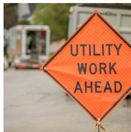
Understanding Utility Easements in Fulton County Page 5