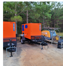
New Bypass Pumps Help Prevent Service Interruptions Page 6