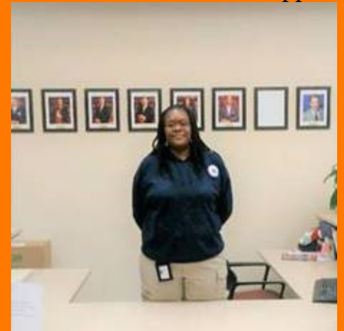
Development Site Inspector, Supervisor