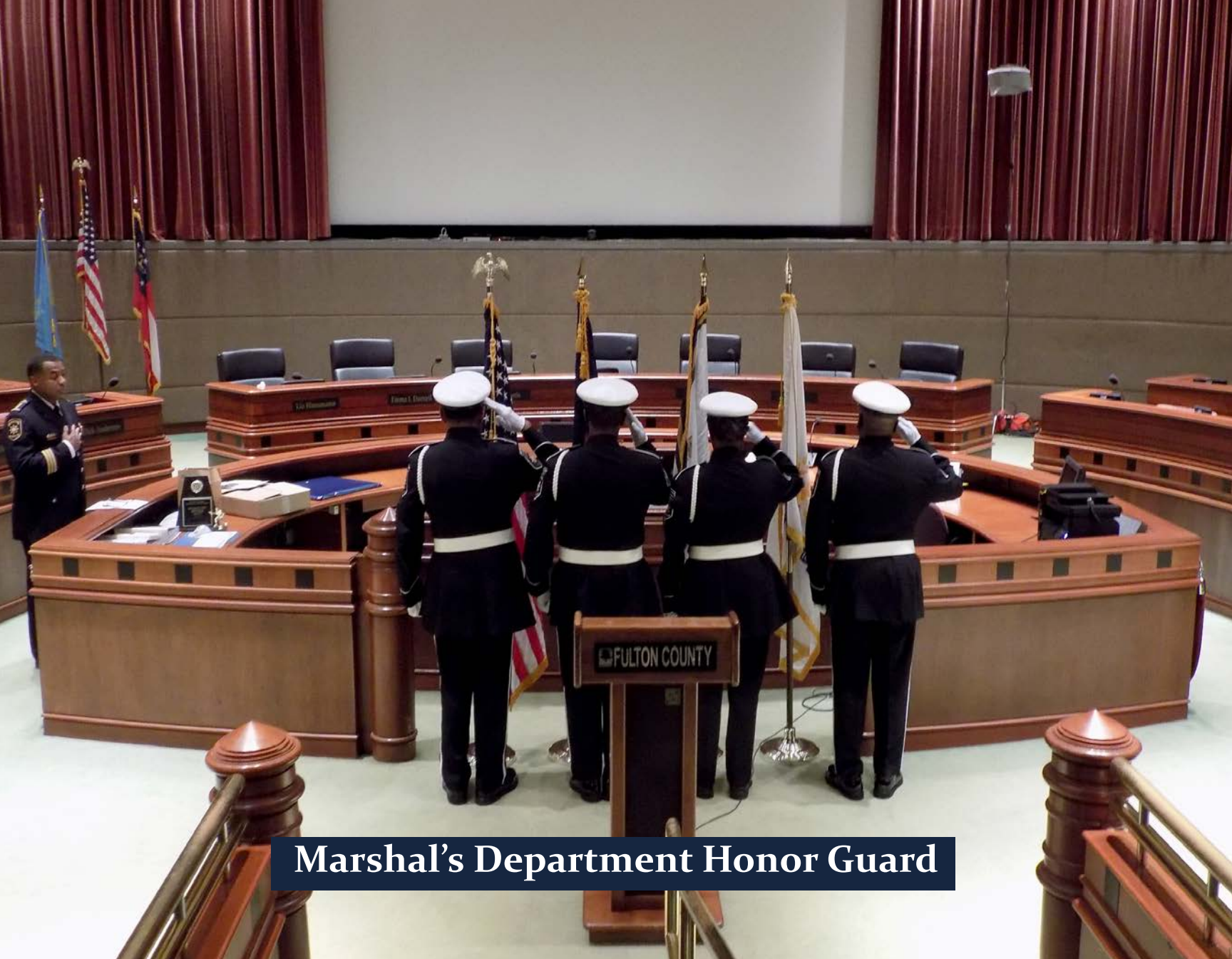
Marshal's Department Honor Guard