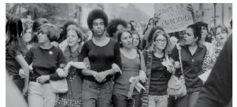
Notable Events in Women U.S. History