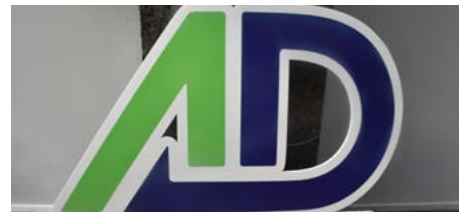
Adult Diversion Training