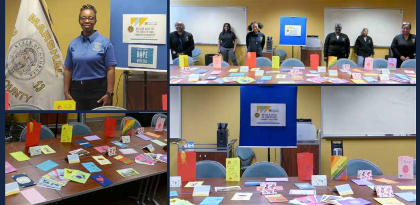
Lending our support to seniors and staff during this COVID-19 pandemic, the department made over 100 hand crafted "Thinking of You" cards for distribution throughout the communities.