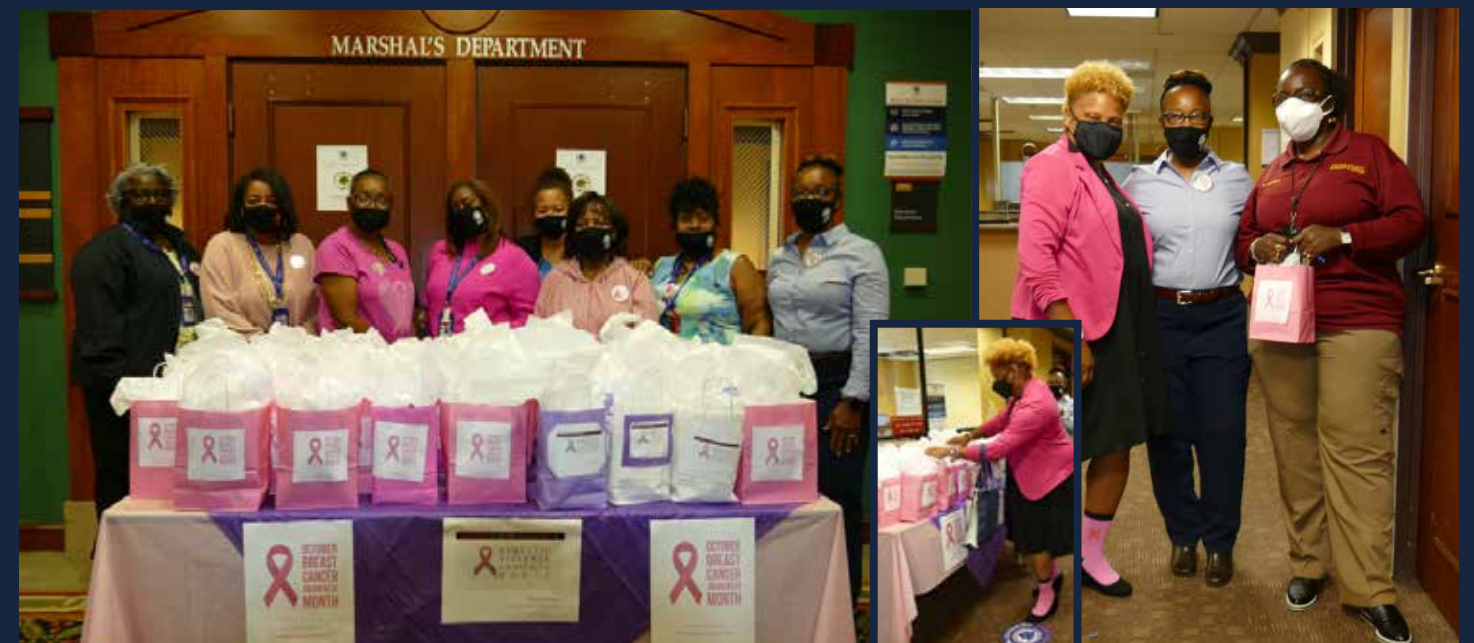
We collected items to fill 46 gift bags for county employees and citizens of Fulton County to honor the survivors of breast cancer and domestic violence. We hope this humble effort made a difference in someone's life.