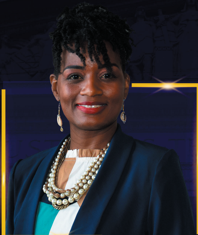
The Honorable NIKIA SMITH SELLERS FULTON COUNTY SUPERIOR COURT (JUDGE ELECT)