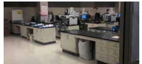
GBI Crime Lab Tour