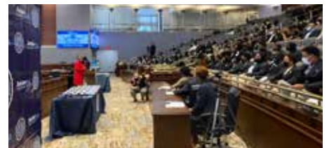
Jr. DA's Graduation