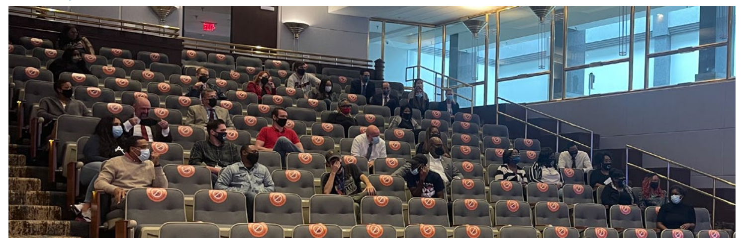
Our Major Case Unit listening to the presentations at the luncheon.