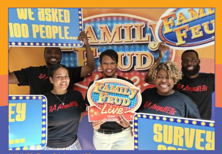
WINNER: Team DA AvengHERs