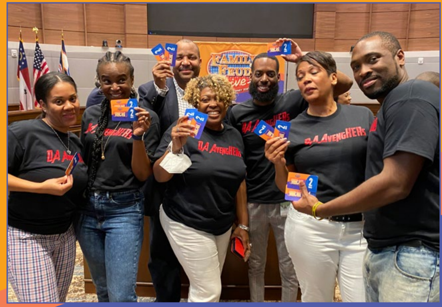
WINNER: Team DA AvengHERs