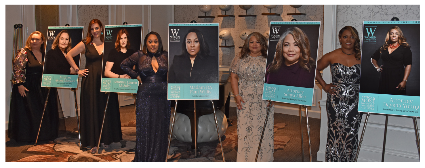
All of our award-winning prosecutors!