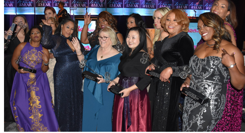
All smiles in the winners' circle!