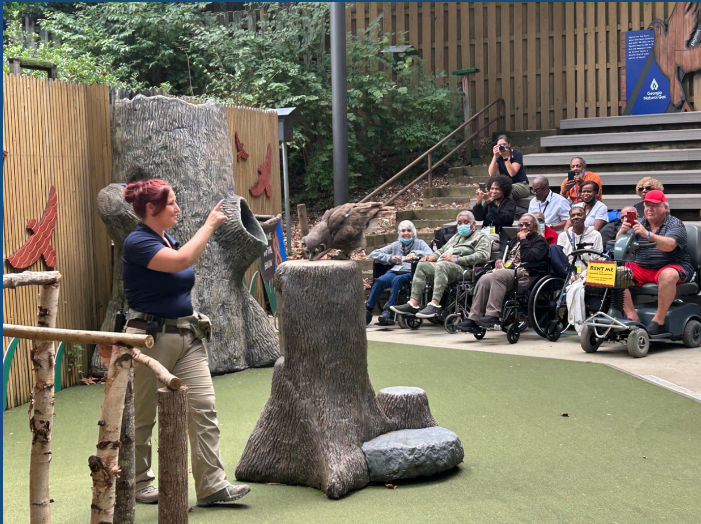
Bird Exhibit at Zoo Atlanta Senior Day