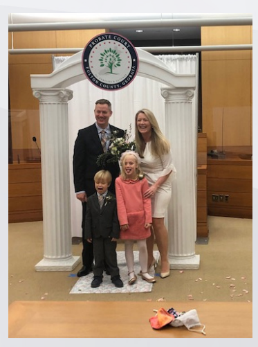
Valentine's Day Weddings at the Courthouse